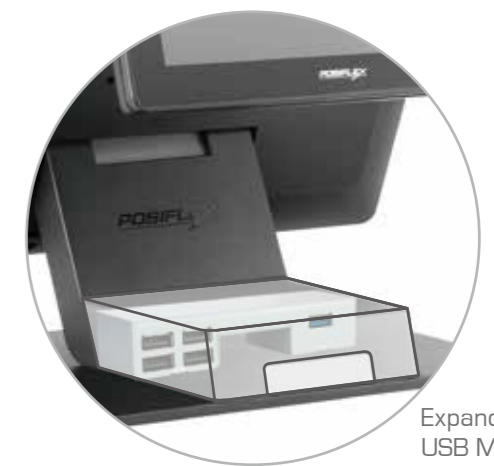
Expandable USB Module

Advanced cable management design delivers a truly clutter-free station. The standard base can house the optional PoweredUSB or USB extension module, while the optional base integrates a UPS backup (RB-5000) for the event of a power failure.