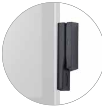
Optional 3 in 1 Module of MSR, RFID and Fingerprint Reader