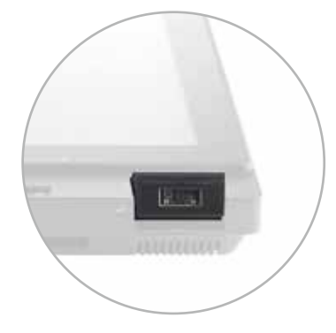
Optional Built-in 2D Barcode Scanner